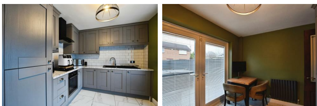
Kitchen/Diner 8'10" x 11'9" (2.70 x 3.60)

Recently installed modern kitchen with a range of contemporary grey shaker style wall and base units, contrasting work surfaces and tiled splash backs, 4 ring gas hob with electric fan oven below and extractor over, composite 1 1/2 bowl sink/drainage with mixer taps over. Integrated washing machine and fridge freezer, central heating radiator and tiled flooring, space for dining table and UPVC French doors to rear garden.