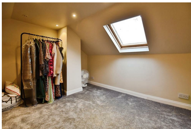
Loft Space 12'0" x 11'9" (3.66 x 3.60)

Accessed via drop down ladder with carpeted flooring, velux window and under eaves storage.