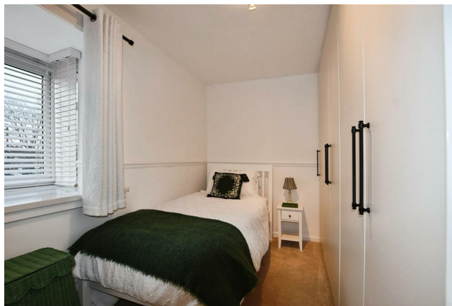
Bedroom 2 8'9" x 11'9" (2.67 x 3.60)

With fitted wardrobes, carpeted flooring, central heating radiator and UPVC window to front aspect.