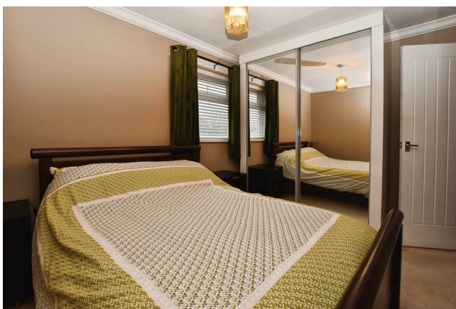
Bedroom 1 8'11" x 11'9" (2.74 x 3.60)

With fitted sliding wardrobes, carpeted flooring, central heating radiator and UPVC window to rear aspect.