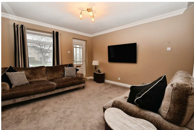
Lounge 15'9" x 11'9" (4.82 x 3.60)

UPVC Entrance door into Lounge with carpeted flooring, central heating radiator, UPVC window to front aspect and open stairs to first floor with under stair storage.